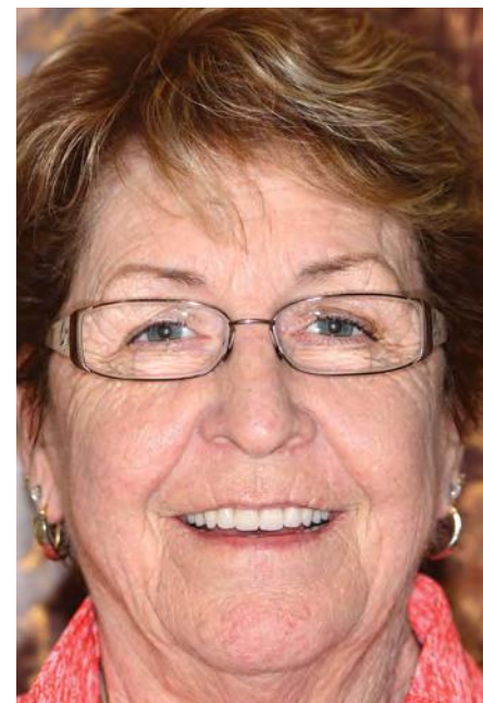
Rehabilitation with All-On-Four®