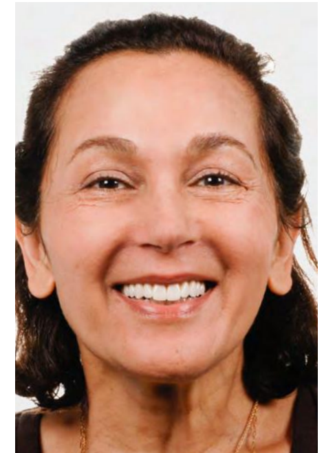
- Rehabilitation with veneers -